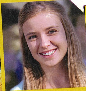
Cert III in Business (SIB30115)

A food service or non food service program is available