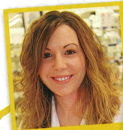
Cert II in Community Pharmacy (SIR20112)