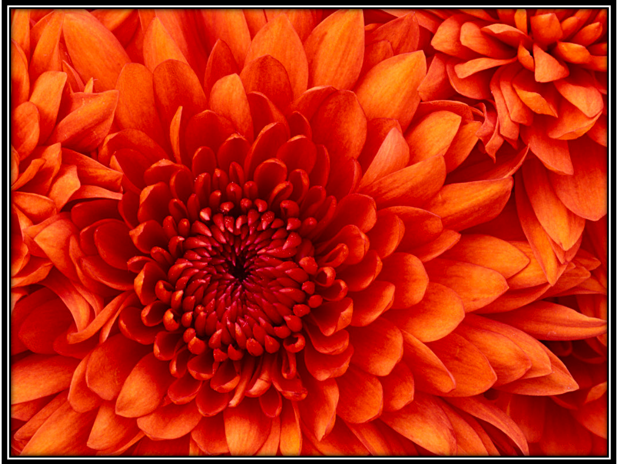
Photo of completed project