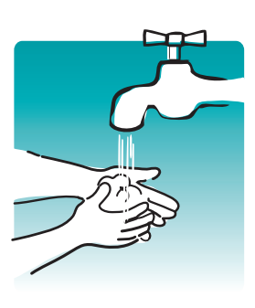
Rinse with water